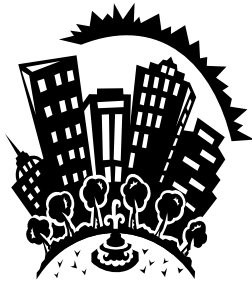
Caption describing picture or